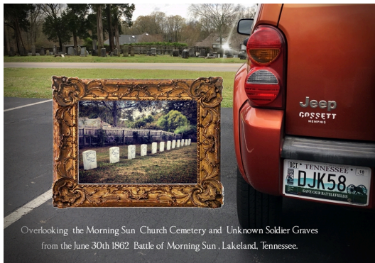
Overlooking the Morning Sun Church Cemetery and Unknown Soldier Graves from the June 30th 1862 Battle of Morning Sun, Lakeland, Tennessee.

Don't know where Morning Sun, TN is? Neither did Gen'l. Sherman until his wagon train was almost wiped out by Confederate cavalry. This Battlefield Preservation supporter visited the site and added a close-up of the Unknown Soldier graves, believed to be Confederate. The battle date as inscribed on the headstones is in error, showing June 6, 1862. The battle was fought on the roads in front of the church. Reportedly bullets were found in the nearby trees for many years.